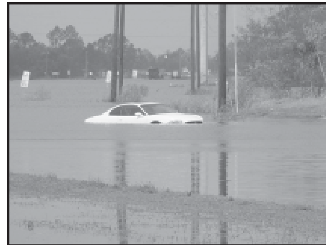
A car stuck in floodwaters in Erath, Louisiana following Hurricane Rita, September 25, 2005.

If you are ordered to evacuate, do so. Contact someone you know to let them know where you will be and how to contact you. Remember to shut off water and electricity at the main stations. Travel light, but take with you small valuables and papers. Lock up your house, but know that shelters do not take animals. Shelter your pets as best you can and leave food and water for them. Drive carefully and leave early, since the roads will be clogged with other evacuees.